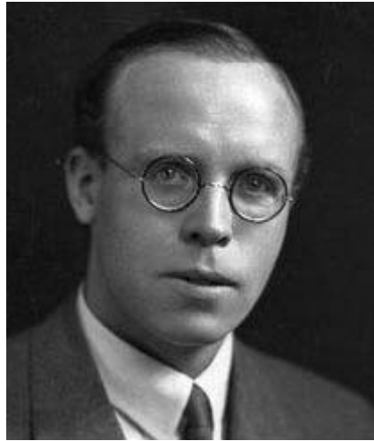
Edward Arthur Milne (1896-1950)